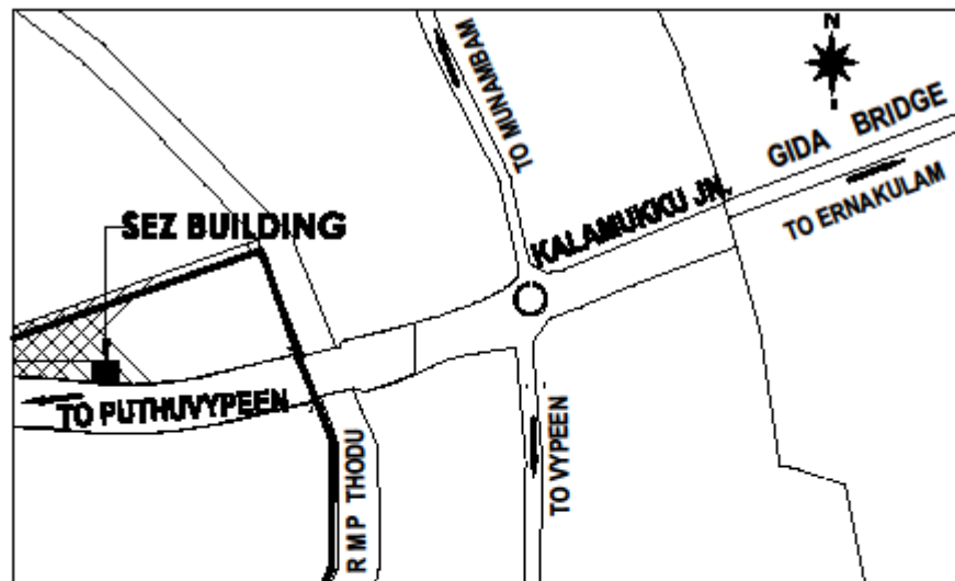
LOCATION PLAN (NOT TO SCALE)